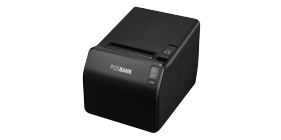
POS Printers • A7, A11