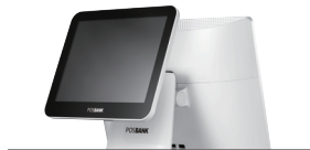
2nd Display • 9.7", 12.1", 15" LCD