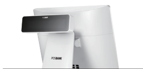
Customer Display • VFD (2 Lines x 20 Characters)